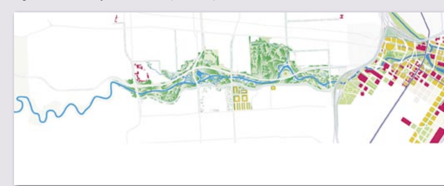
Figure 2. Buffalo Bayou Master Plan, Houston, Texas

Response to the flood hazard in Houston until the 1980s was emphatically structural. The Army Corps of Engineers and the Harris County Flood Control District