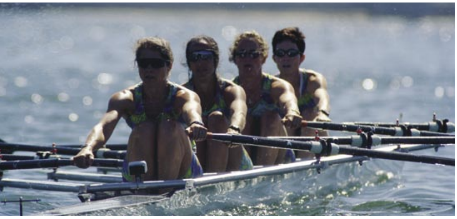
Urban watersheds provide various ecological services as well as recreational opportunities, as the Portland, Oregon, women's rowing team demonstrates.

at hand is the Springwater Corridor rail trail following Johnson Creek into the city. To the east the blue-green pastels of a three-story high heron mural catch the eye, a work painted by a local artist that brightens a side wall of an otherwise ruststained, blocky old building. The Portland skyline rises in the background like the Emerald City. This is a glimpse of how enlightened management of local streams, wetlands, and watersheds may contribute to more sustainable and humane metropolitan environments of the future.