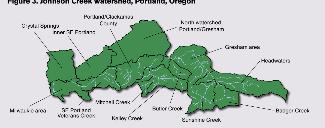
Figure 3. Johnson Creek watershed, Portland, Oregon

With FEMA's encouragement, Blumenauer and the council in 1998 convened the first Johnson Creek Watershed Summit involving public agencies, schools, nonprofits, and private citizens. A vision