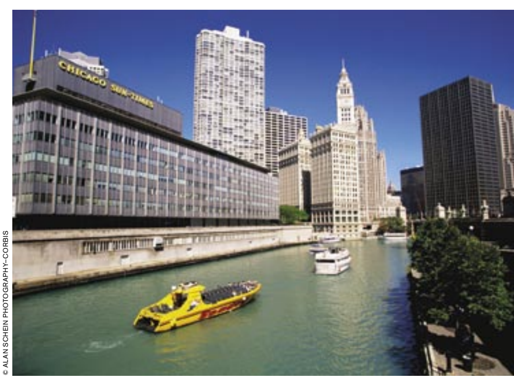
Tour boats float on the highly channelized Chicago River.

project scale, the "design with nature" axiom was broadened to a regional scale by MIT professor of landscape architecture Anne Whiston Spirn in The Granite Garden : "The city, suburbs, and the countryside must be viewed as a single, evolv-